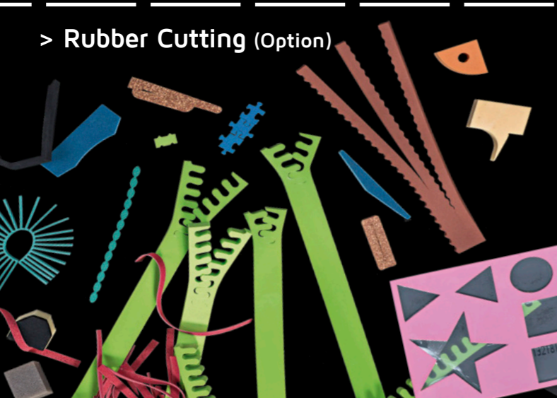
> Rubber Cutting (Option)