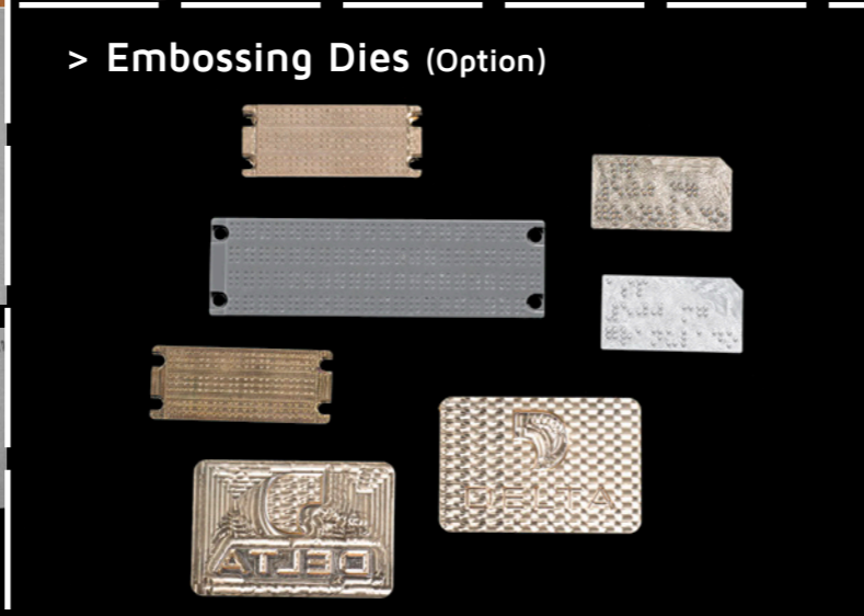
> Embossing Dies (Option)